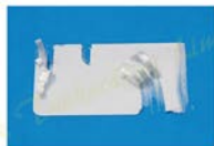
Co-Extruded Destructible Material & Label