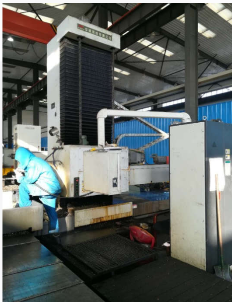
TK6516A数控卧式铣镗床 TK6516A CNC Horizontal Boring&Milling Machine