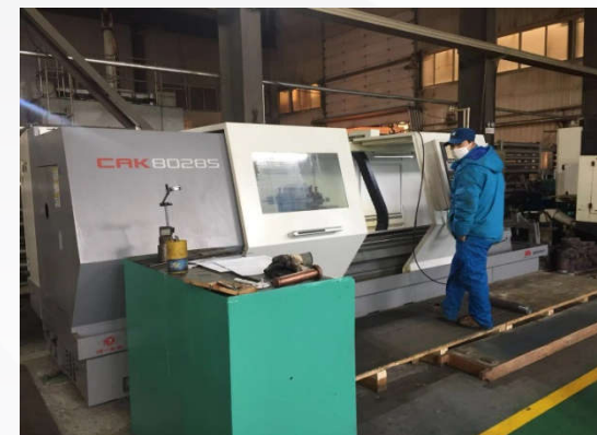
CAK80285数控车床 CAK80285 CNC Lathe