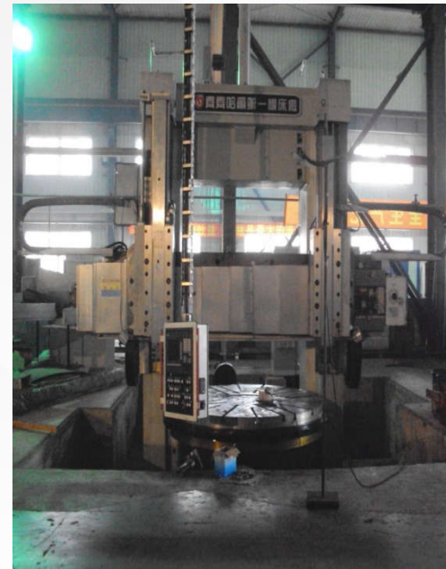
2.5米数控立车 2.5m CNC Vertical Lathe