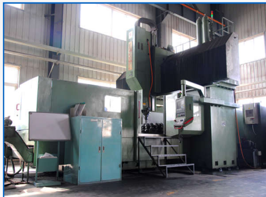
Xk23163龙门式镗铣 Xk23163 Gantry Boring&Milling