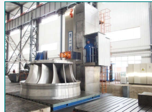
TK6920A七轴四联动数控铣镗床 TK6920A Seven Axes Four Linkages Boring&Milling