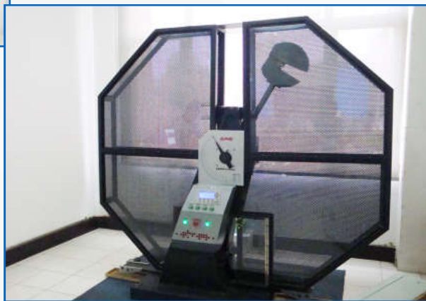
冲击试验机 Impact Testing Device