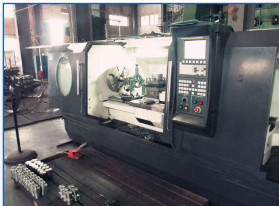
CAK50135数控卧车 CAK50135 CNC Horizontal Lathe