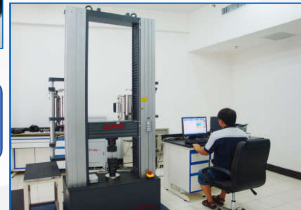
万能拉伸试验机 Tensile Testing device