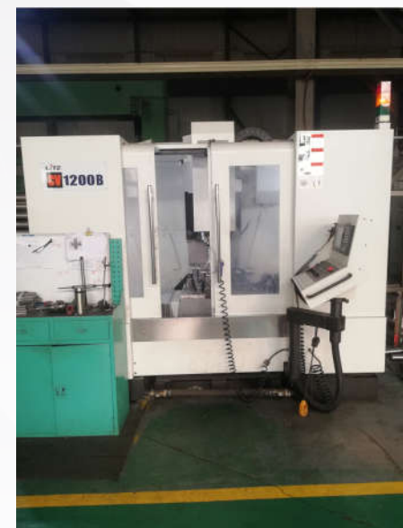
CV-1200B立式加工中心 CV-1200B Vertical Machine center