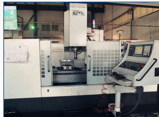
SV1100B数控加工中心 SV1100 CNC Machining Center