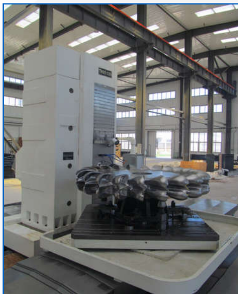
TK6513数控落地铣镗床 TK6513 CNC Horizontal Boring&Milling Machine