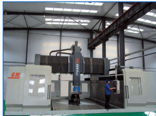
M4000H/2五坐标横梁移动龙门 M4000H/2 Five Axes Full Linkages Boring&Milling