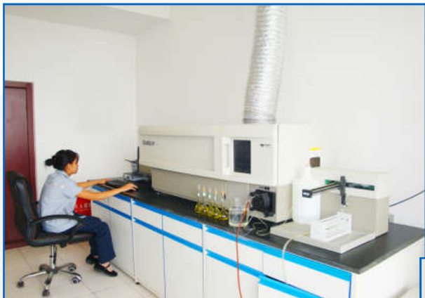
电感耦合等离子发射光谱仪 ICP Spectrum