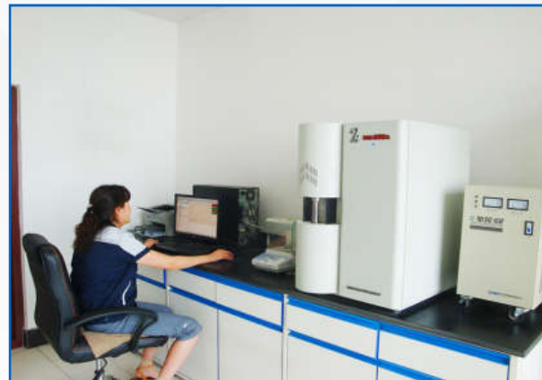
红外碳硫分析仪 Infra-red Carbon&Sulfur Analysis Device