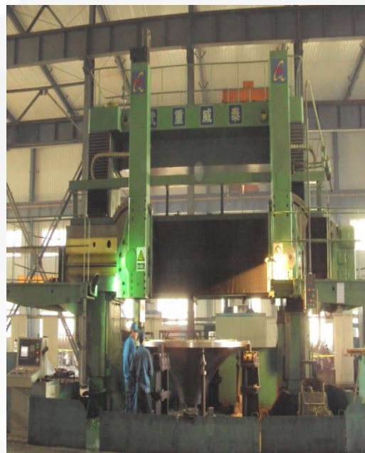
6.3米数控立车 6.3m CNC Vertical Lathe