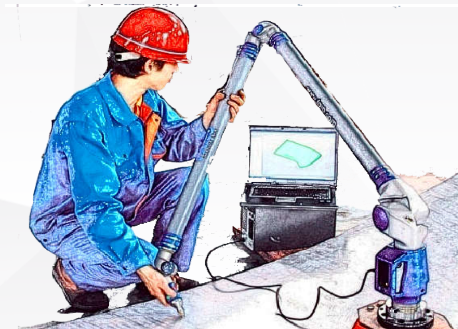
三坐标测量臂检测型线 Profile Checking by Measurement Arm