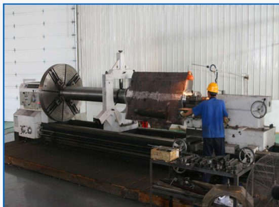
CW61160卧车 CW61160 Horizontal Lathe