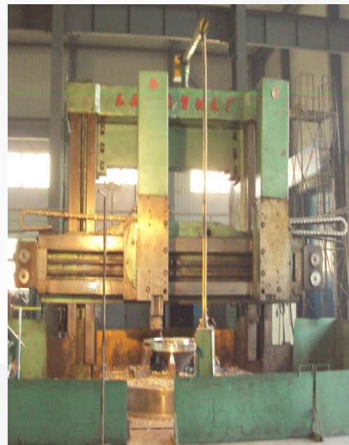
3.15米立车 3.15m Vertical Lathe