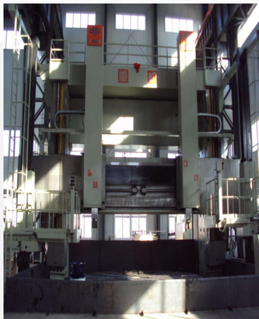
8米数控立车 8m CNC Vertical Lathe