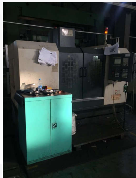
BOVM8050A立式加工中心 BOVM8050A Vertical Machine center