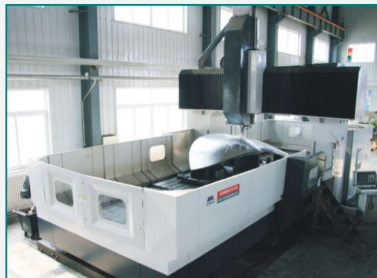
GMB2540龙门式镗铣 GMB2540 Gantry Boring&Milling